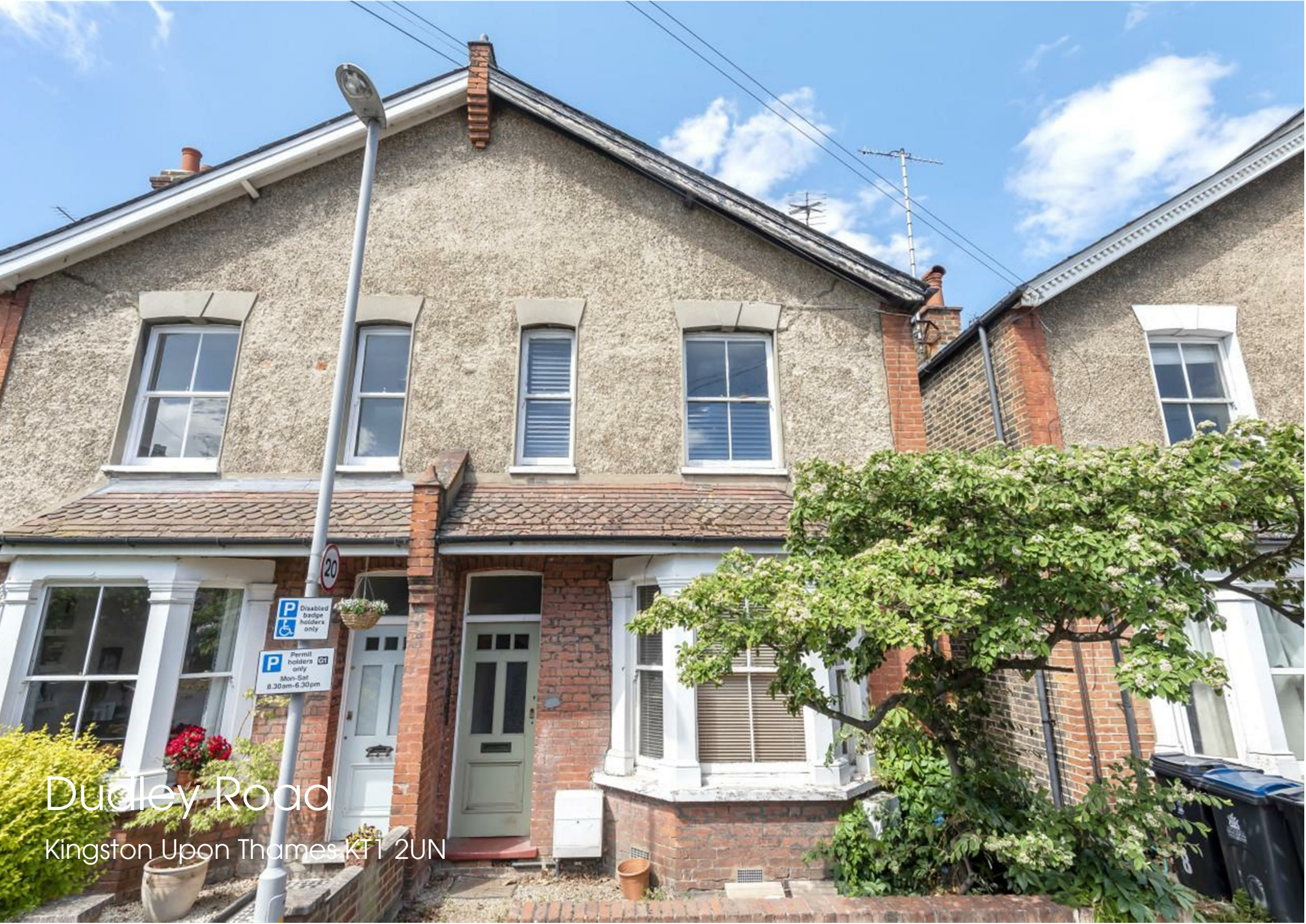
Dudley Road Kingston upon Thames KT1 2UN